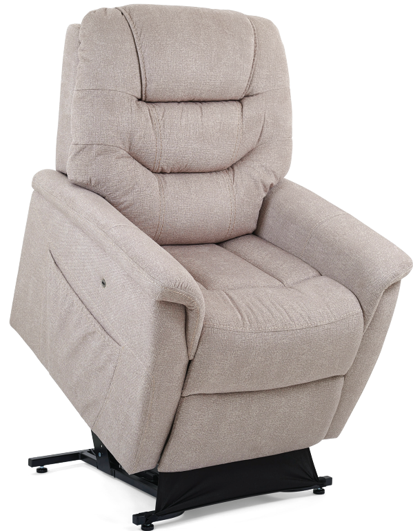
shown in Antler